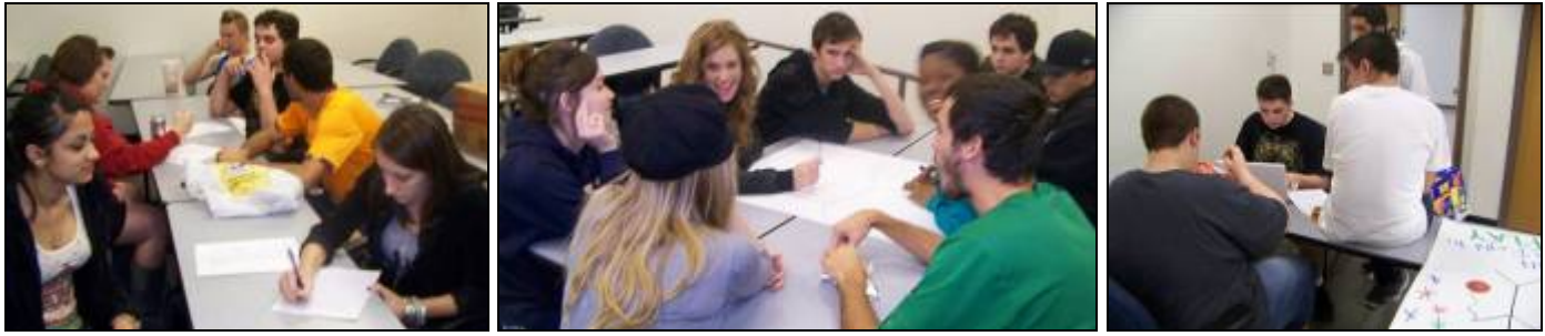
Working in committees to prepare for the event, including parking & lunch detail, handling the speakers, introducing the human rights, decorations, registration, media/press, documentation, AV, photography, videography, breakout sessions – you name it!