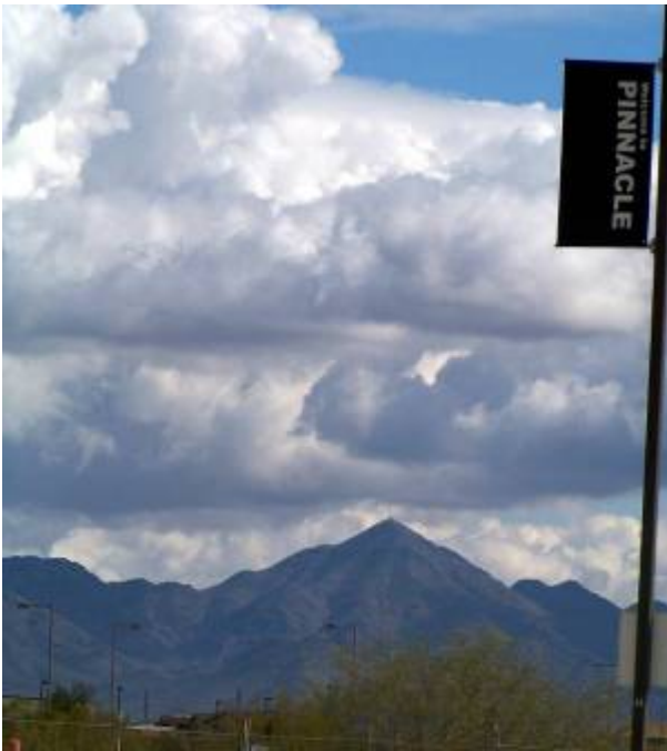
Looking north from the high school on 1/23

☆ Final preparation meetings: February 1, 3, 4 ☆ Our event: February 5 th !!!!!!